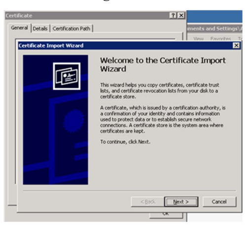
Figure 5 Certificate Import Wizard Step 3

following store click the Browse button.