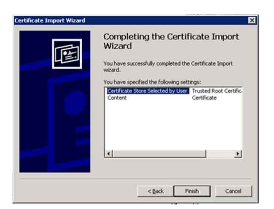
Figure 8 Certificate Import Wizard Step 6

You have now successfully imported a Fault Root Certificate for testing with the GSA ICAM Test Cards, you may see a Security Warning appear – if this occurs simply select yes.